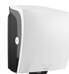
82094 Katrin Plastic Dispenser For System Paper Towel Roll, White

This leaflet is provided for information purposes only and no liability of any kind is accepted for potential errors or inaccuracies. Metsä Tissue reserves the right to alter its products, product information and product range without any notice.