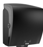
82070 Katrin Plastic Dispenser For System Paper Towel Roll, Black