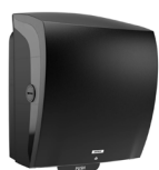
84753 Katrin Hybrid Dispenser For System Paper Towel Roll, Black

Selection from all countries. Please refer to web page for market-specific availability.