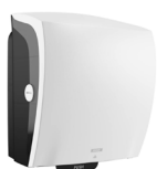
84739 Katrin Hybrid Dispenser For System Paper Towel Roll, White